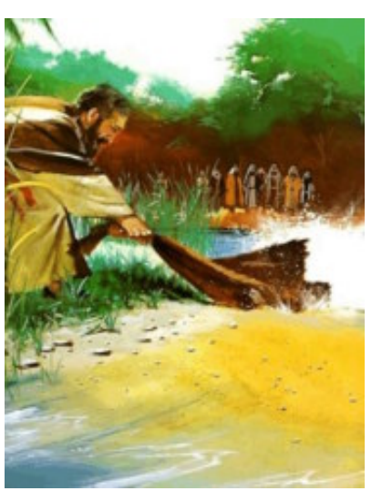
Elijah and the Chariot of Fire