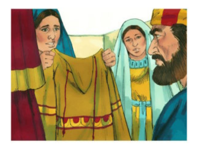
What did the widows show Peter?