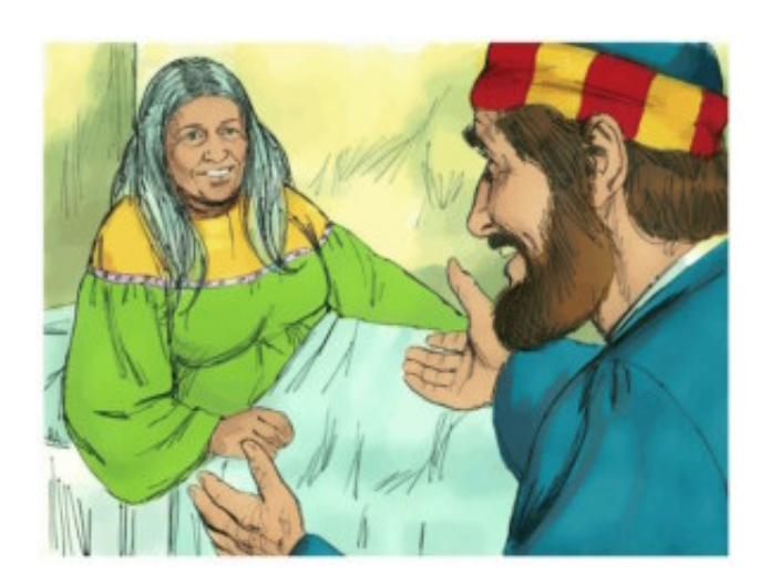
What did Peter say to the dead woman?