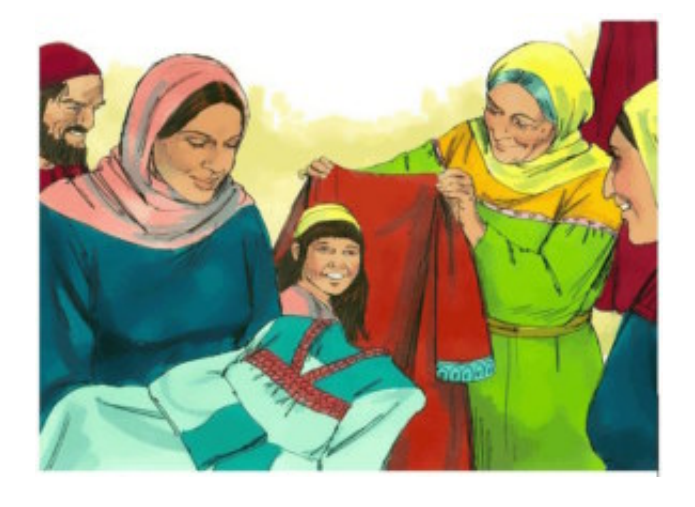
What did Dorcas make for the widows and the poor?