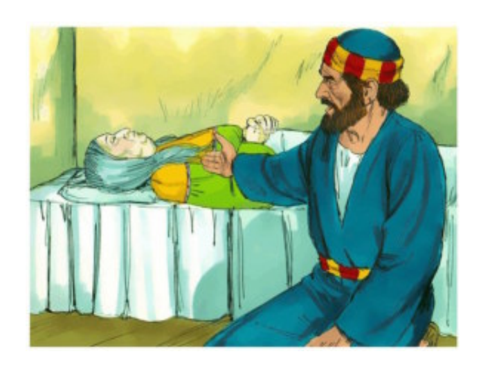
After telling everyone to leave the room, what did Peter do?