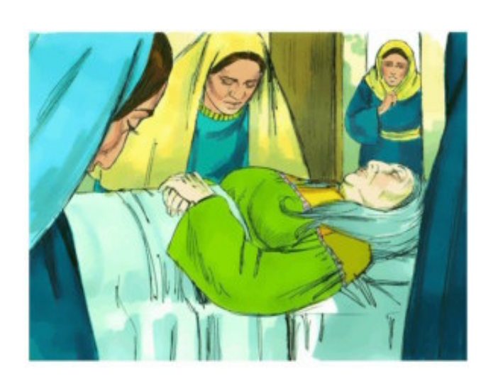
What happened to Dorcas?