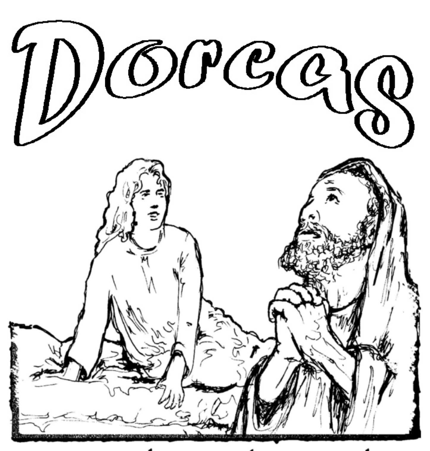
Raised From the Dead