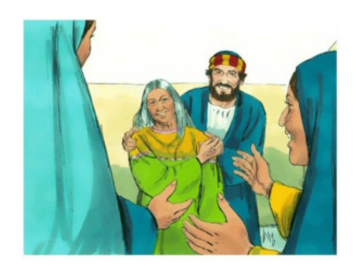
After helping Dorcas to stand up, whom did Peter call for?