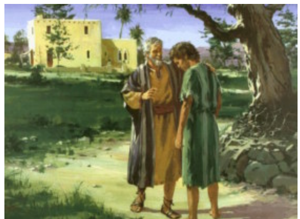
The father forgives his _____.