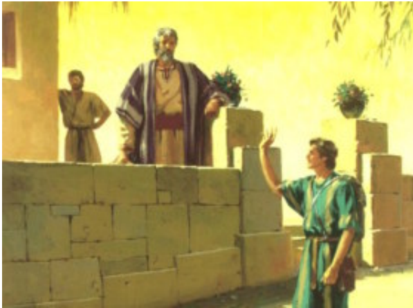
The prodigal son tells his _____ goodbye.