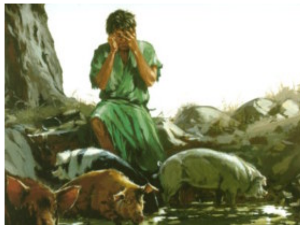
The prodigal son is feeding _____.