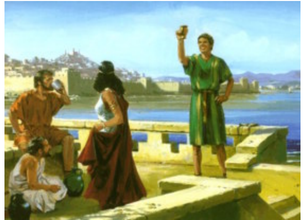
The prodigal son spends all of his _____.