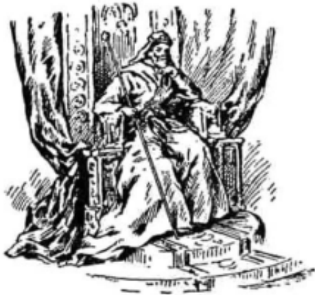
"The kingdom of heaven [is] likened unto a certain _____"