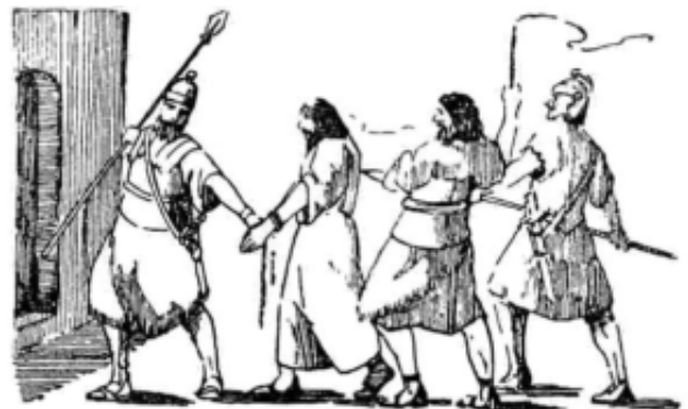
"His lord . . . delivered him to the _____, till he should pay."