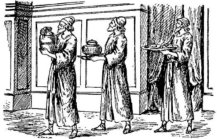
"which would take _____ of his servants."