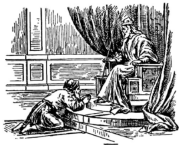
"Lord, have _____ with me, and I will pay thee all."