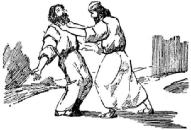
"The same servant . . . found one . . . which owed him an _____ pence."