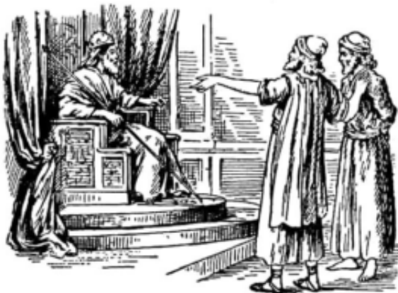
"one was brought . . . which owed him ten _____ talents."