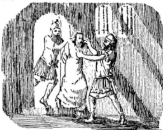
"He . . . cast him into _____, till he should pay the debt."