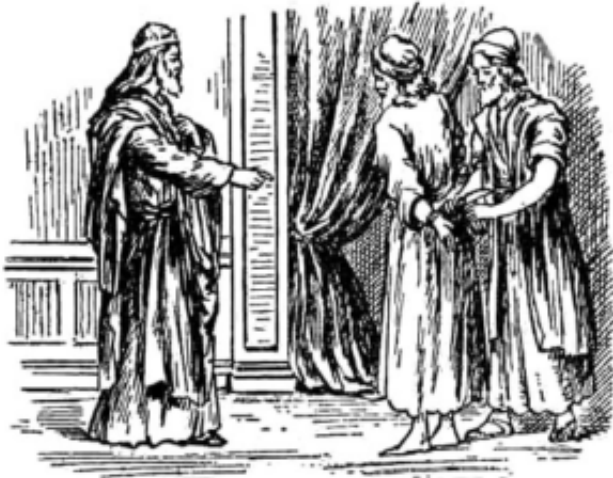
"Then the Lord . . . _____ him the debt."