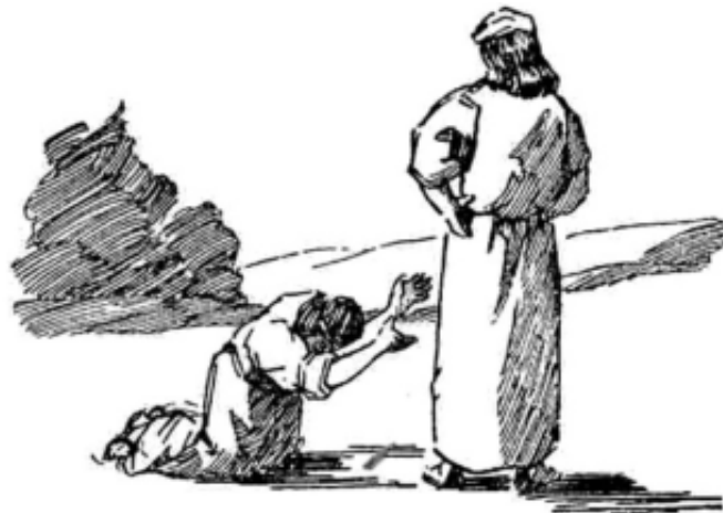
"Have patience with me, and I will pay thee _____."