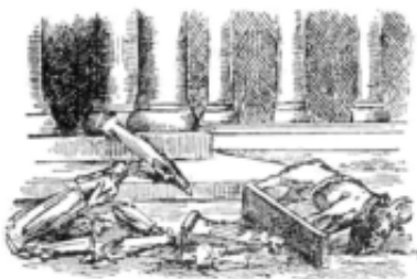
What was destroyed?