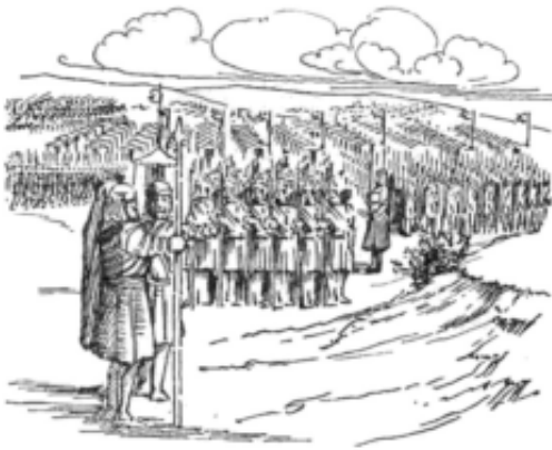
The King of Syria gathered all his _____.