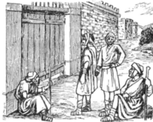
The lepers decide to leave the city _____.