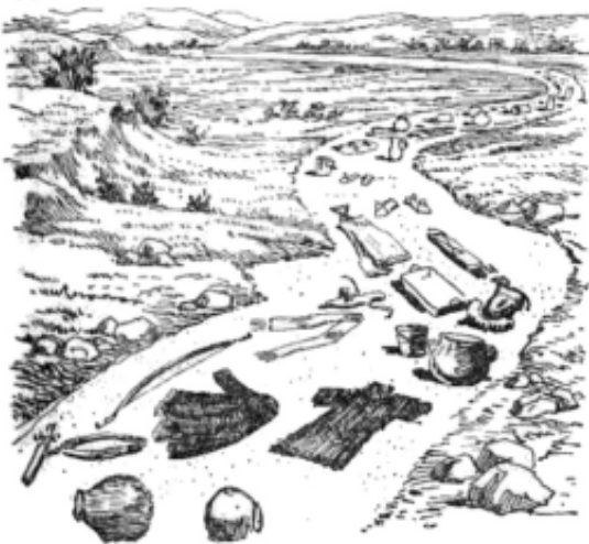
The road was full of vessels and _____.