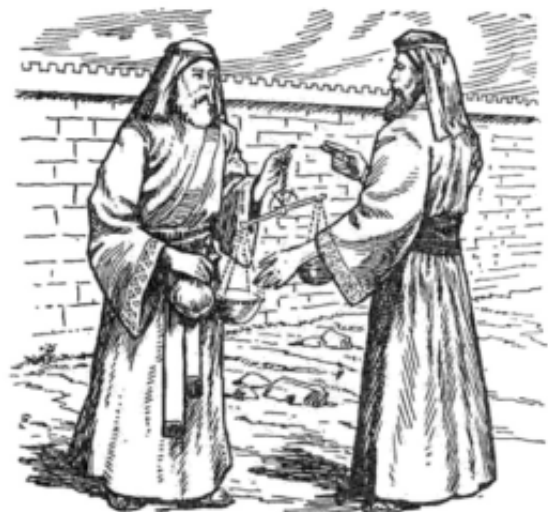
Food was sold very _____.