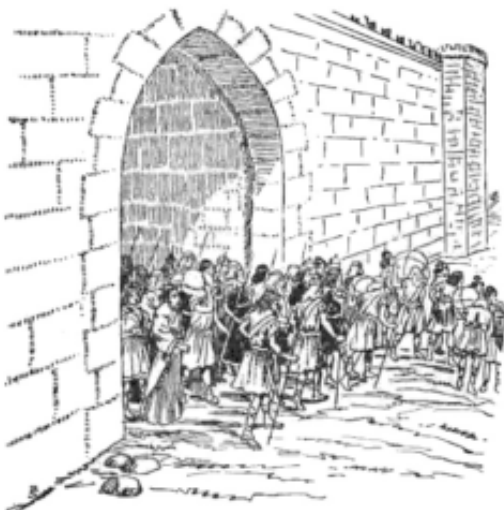
The people trampled the king's _____ at the gate.