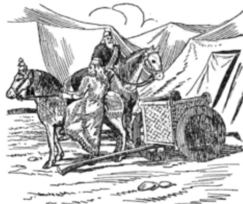
The king sent men to search for the _____ army.