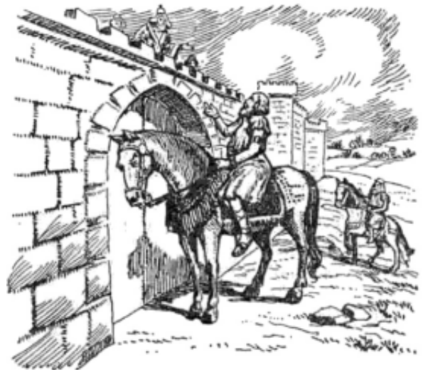
The men returned and told the _____.