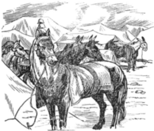
The lepers found no _____ in the Syrian camp.